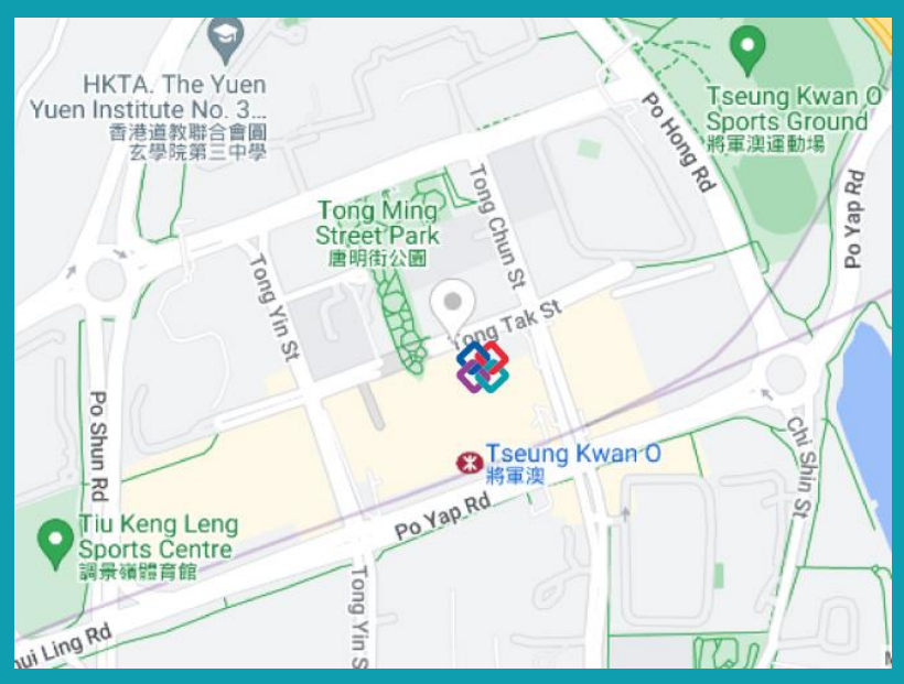
Click to enlarge map

Tower 5, 3 Tong Tak Street, Tseung Kwan O, Hong Kong